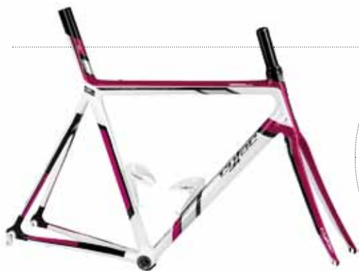
CYFAC ABSOLU Nestled in France's picturesque Loire Valley, Cyfac has been expertly crafting bicycle frames for more than 25 years. Drawing inspiration from the world-famous vineyards and epic cycling lanes of the territory, each frame focuses on each customer's unique needs and specific geometries. Frames are finished using eco-friendly paints from more than 30,000 stock colours and custom tints.