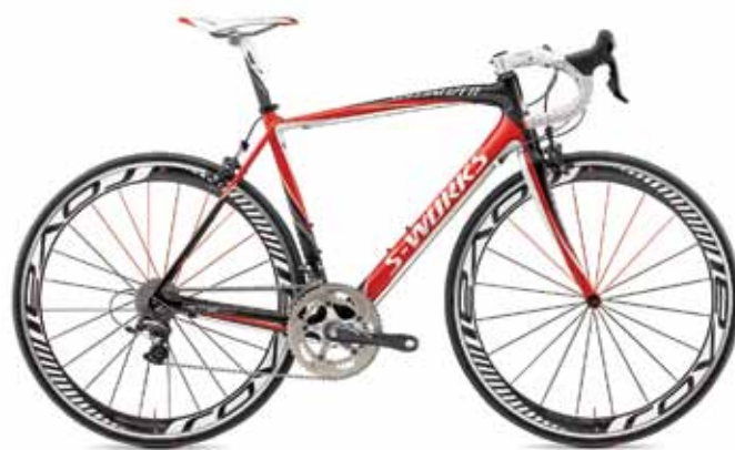
SPECIALIZED S-WORKS TARMAC SL3 DURA ACE The chosen bike of two time Tour de France winner Alberto Contador, the extremely rigid FACT carbon frame is the perfect choice for the biggest cycle race of the year. Now also available custom-fitted. Around US$7,700. www.specialized.com