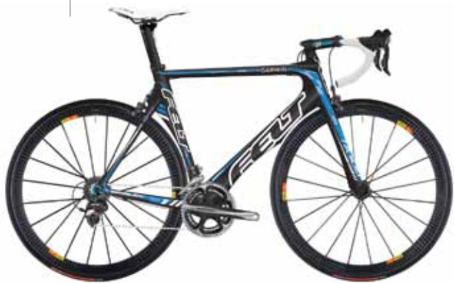
Built for speed, the FELT AR1 Di2 is engineered with an exceptionally aerodynamic and stiff UHC-Nano carbon-fibre frame, outfitted with Shimano Dura-Ace 7970 Di2 electronic shifting. Around US$9,999. www.feltbicycles.com